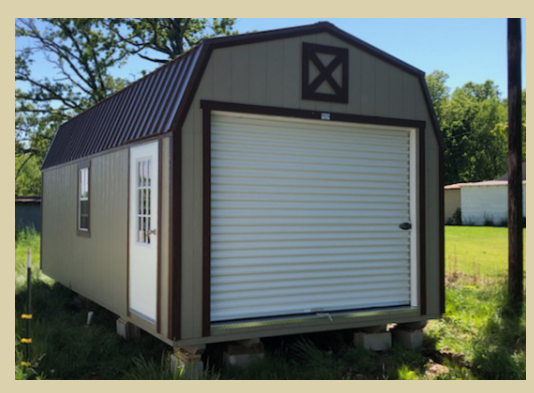
*If the garage will be used for vehicle storage a level concrete or gravel pad and a double layer of flooring is required