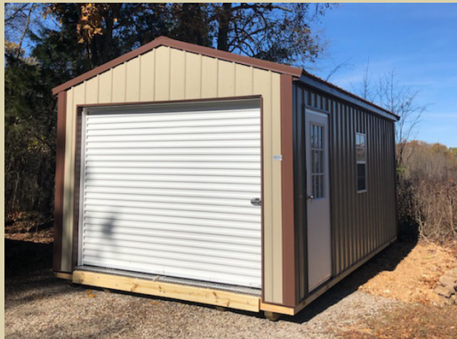
*If the garage will be used for vehicle storage a level concrete or gravel pad and a double layer of flooring is required